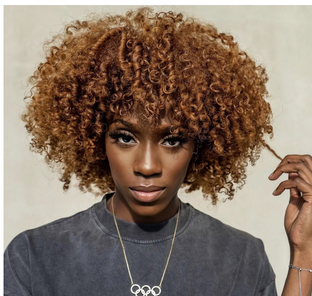
Ashley Spencer Lawrence North Class of 2011

Ashley Spencer is an elite track and field athlete who won a bronze medal in the 400m sprint in the 2016 Summer Olympics in Rio de Janeiro. Her running career began at LN where she led the Wildcats to IHSAA track & field championships in 2009 and 2011. During her high school career, she won 12 IHSAA individual and relay state titles. She won two NCAA championships in the 400m for the University of Illinois and ran for the University of Texas.