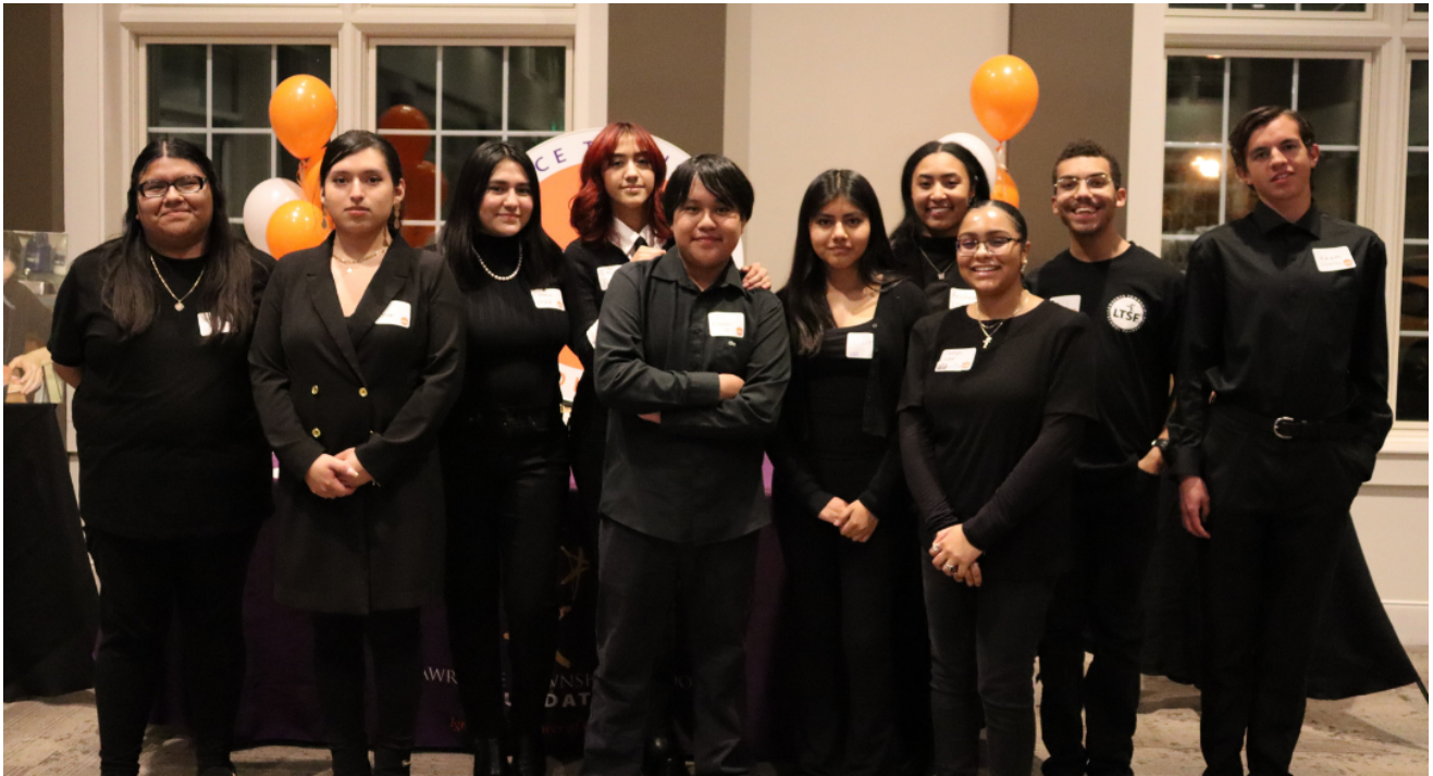
LTSSF students greeting donors and community members at the LTSSF Thanks for Giving Reception at Westminster Village North on November 15, 2022.