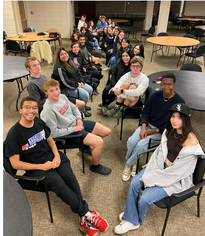
LTSSF students getting to know each other by "speed dating" during one of their meetings.

This year, there are 35 students in LTSSF representing both high schools. The group has held two lunchtime fundraisers at each high school this semester, and volunteered their time at the LTSSF Thanks for Giving Reception in November greeting guests.