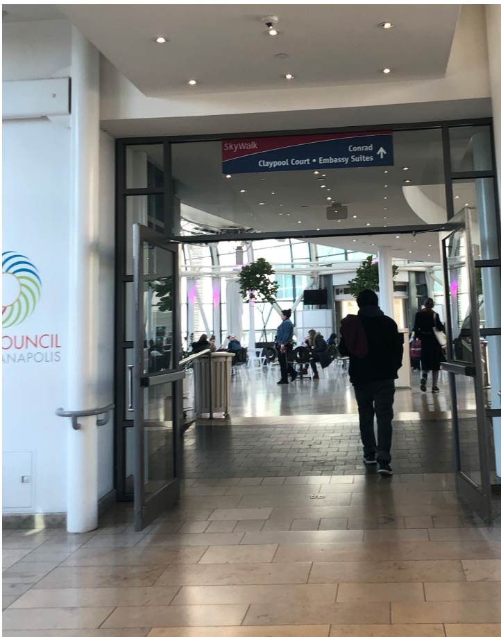
Entrance into the Arts Garden Step 2